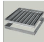
FLOOR ACCESS COVERS

To arrange a CPD Seminar at your premises or online: