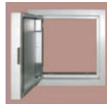
WALL AND CEILING ACCESS