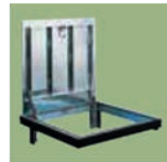
FLOOR ACCESS DOORS